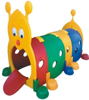
SAMPLE CATERPILLAR TUNNEL