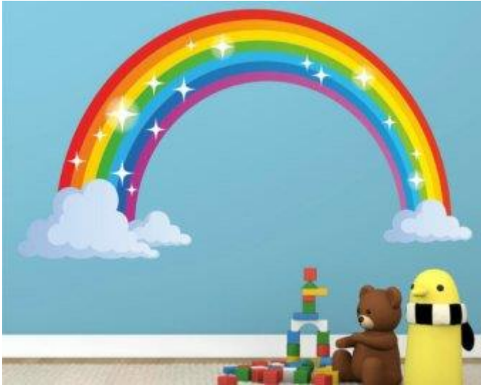
EXAMPLE OF WALL PAINT AND MURAL