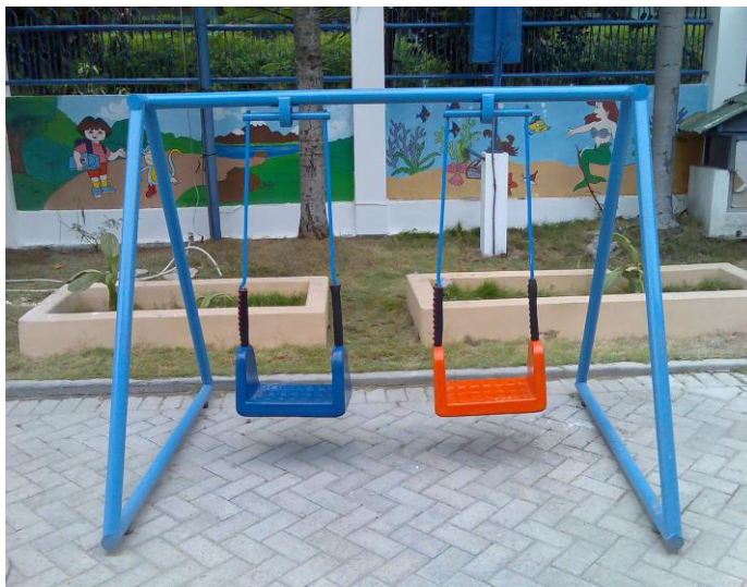
SAMPLE DOUBLE SWING