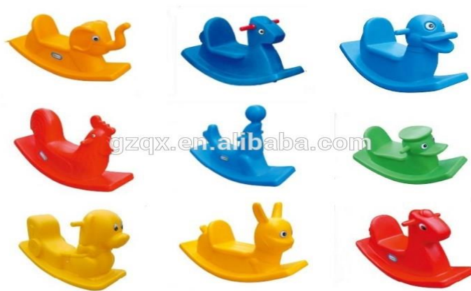
SAMPLE INDOOR SEESAW