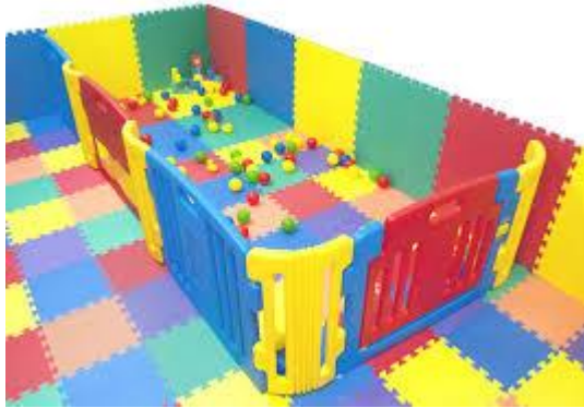
EXAMPLE 1 WALL PADDING