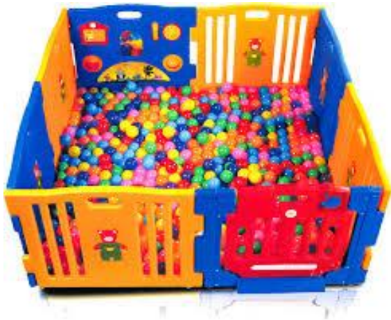
SAMPLE PLAYPEN WITH MULTI-COLORED BALLS