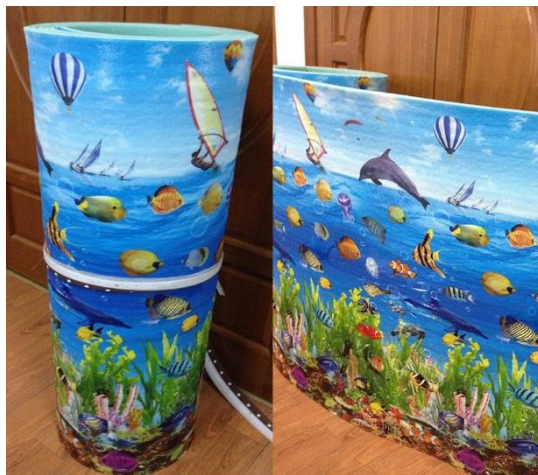
EXAMPLE 2 WALL PADDING