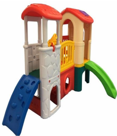
SAMPLE DELUXE PALYGROUND